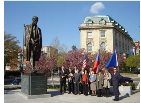
Masaryk Memorial, Washington, DC

In 2002 AFoCR established a memorial in Washington, DC, to Tomáš G. Masaryk, the first president of Czechoslovakia. President Wilson collaborated closely with President Masaryk to secure the independence of Czechoslovakia in 1918, and the Czech people revered Wilson for his leadership and vision. The Wilson Monument in Prague, as the counterpart of the Masaryk Memorial, will complete the symbolization of the long standing Transatlantic ties of friendship and democratic values held in common by the American and Czech peoples. It will commemorate the rebirth of Czech democracy after decades of suppression.