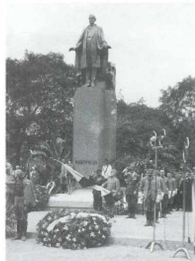
The first Wilson Monument was dedicated on July 4, 1928, by a grateful Czechoslovak nation.

As the counterpart of the Masaryk Memorial in Washington, D.C., the Wilson Monument will complete the symbolization of the joint democratic values of, and the ties of friendship between, the American and Czech peoples. The monument will commemorate the rebirth of Czech democracy after decades of suppression. Its dedication will coincide with the completion of the renovation of the station in 2011 or 2012. ■