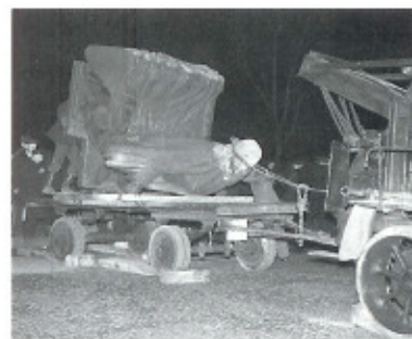
The Wilson Monument stood from 1928 until December 11, 1941, when it was ordered destroyed by Reichsprotektor Reinhard Heydrich after the United States declared war on Germany.